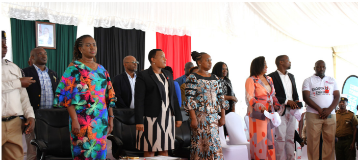
The launch of 16 Days of Activism Against Gender-Based Violence in Makeni County.