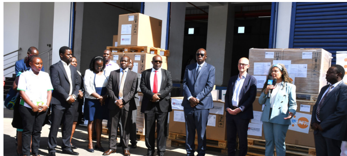
UK Government donates Reproductive Health Commodity to KEMSA at the Supply Chain Centre in Nairobi.