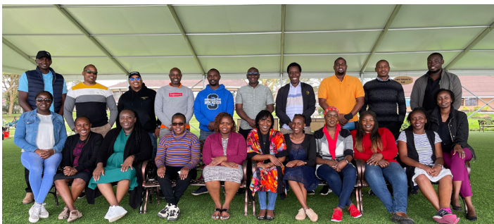
Accelerate consortium partners year five work plan engagement.