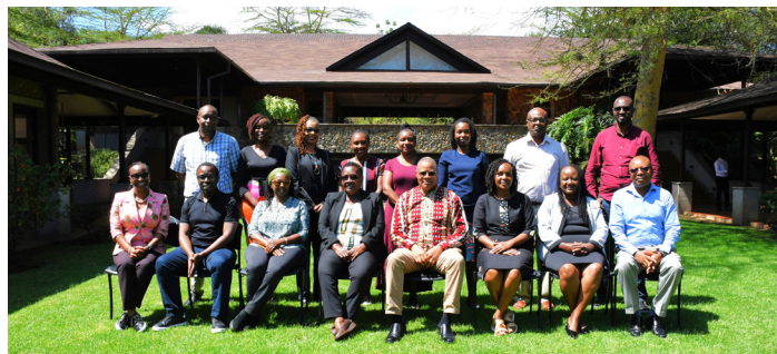
The PS Kenya Board of Directors and senior management end of year meeting.