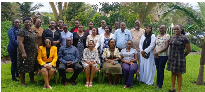
Development of family planning 'NEST' magazine workshop by NCPD.